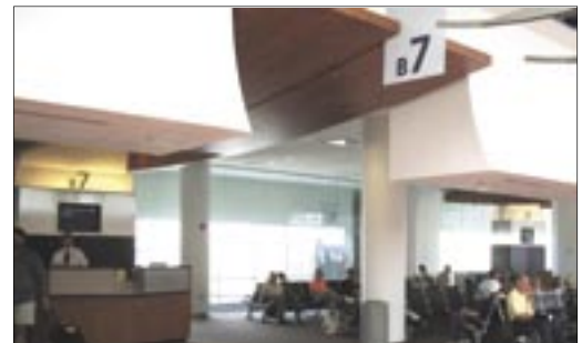
New regional jet gates

These are just a few of the changes that reflect the transformation the Louisville