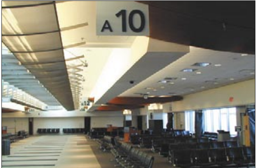
Gate A10 renovation nears completion.