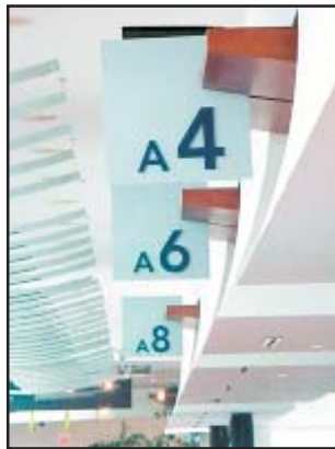
New gate numbers make it easier to find your gate.