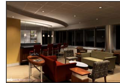
Altitude - A Travelers Club

Opening in mid-May are three regional jet gates in each concourse with passenger boarding bridges and covered bag valets. This enables travelers to go from gate to jet in a climate-controlled environment. It also permits them to gate check bags indoors, rather than on the ramp.