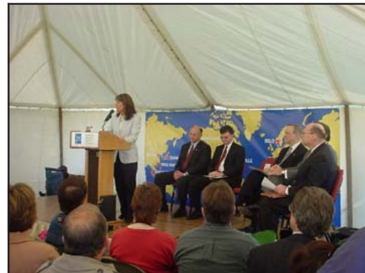
Congresswoman Northup touted the expansion as a boon to the local economy.

"The runway extension will enable Louisville companies to move their products more quickly to one of the fastest growing markets in the world," Abramson said. "As a result, the ability of our airports to serve as an economic engine